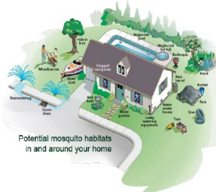
Potential mosquito habitats in and around your home